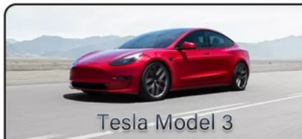
Tesla Model 3