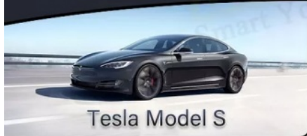
Tesla Model S