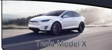
Tesla Model X