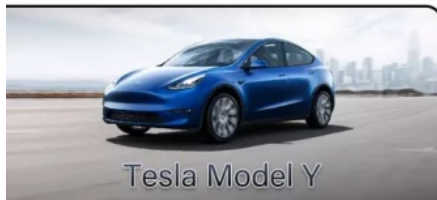
Tesla Model Y